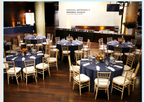
CONCOURSE LOBBY Capacity: 400 standing 300 seated

By hosting your event at the 9/11 Memorial & Museum, you directly support our mission of commemoration, education, and inspiration. Corporate Partners of the 9/11 Memorial & Museum receive a 50% discount on event fees.