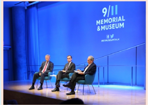
AUDITORIUM Capacity: 157