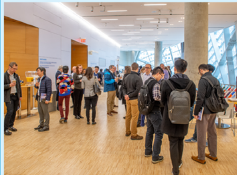
ATRIUM TERRACE Capacity: 165 standing 135 seated

All experiences can be customized to meet your event goals. All pricing based on a two-hour event minimum.