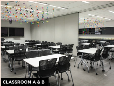
CLASSROOM A & B